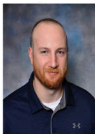
Butch Dwyer Insurance Services Plus