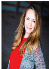
Kelsey Cooling Embars Cocktail Lounge & Bar