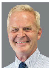
Dan Hawkes Commercial Condos